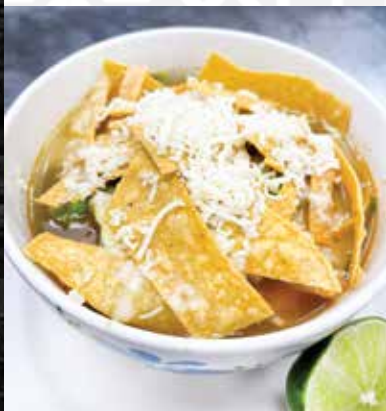
Chicken Tortilla Soup