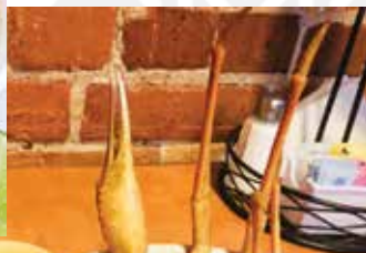
Caldo de Mariscos