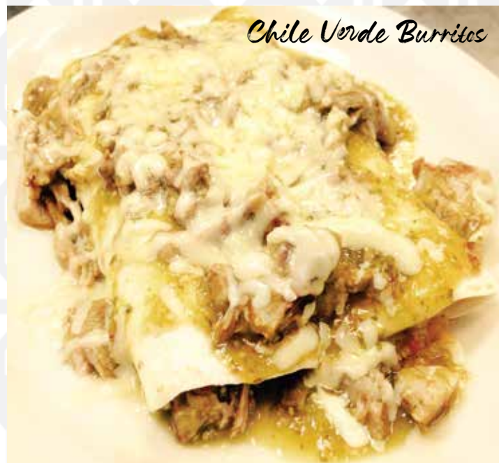
Chile Verde Burritos

*THESE ITEMS MAY BE SERVED RAW OR UNDERCOOKED CONSUMING RAW OR UNDERCOOKED STEAK OR EGGS MAY INCREASE YOUR RISK OF FOODBORNE ILLNESS