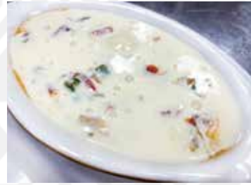
Pico Cheese Dip